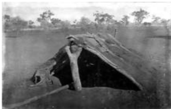
A traditional aboriginal mia